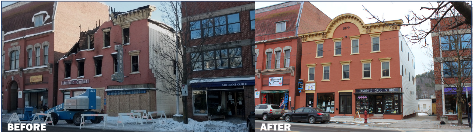
After a fire just before Christmas 2012, the Landry Block (1879) on Railroad Street in St. Johnsbury was saved and rehabilitated with the aid of tax credits in 2013. Not only was the historic character of the building preserved, code improvements mean the two commercial units and four apartments are now fully accessible.

Again, excluding elevator cars – 89% of materials were purchased locally. Given that tax credits are not paid out until the project is complete; the project starts to pay back the state's investment immediately with revenues generated from taxes on wages and the purchase of local materials. A Maryland study found that for every $1 paid out by the State, $0.34 was returned prior to any credit being paid out, $1.02 was returned in the first year, and $3.31 in the fifth year after the project's completion. This study showed that the balance of forgone revenue is returned within a year of project completion; thereafter, the increased property taxes become a revenue generator.